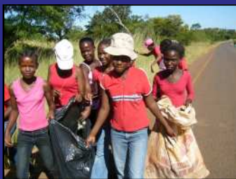
1st Shiluvane performing their Community Service